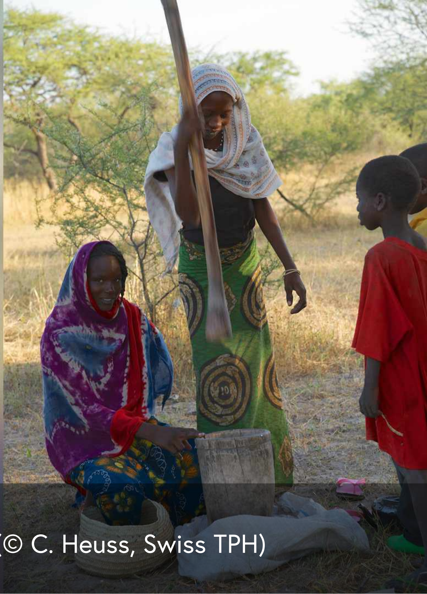
Gredaya Falls, Africa