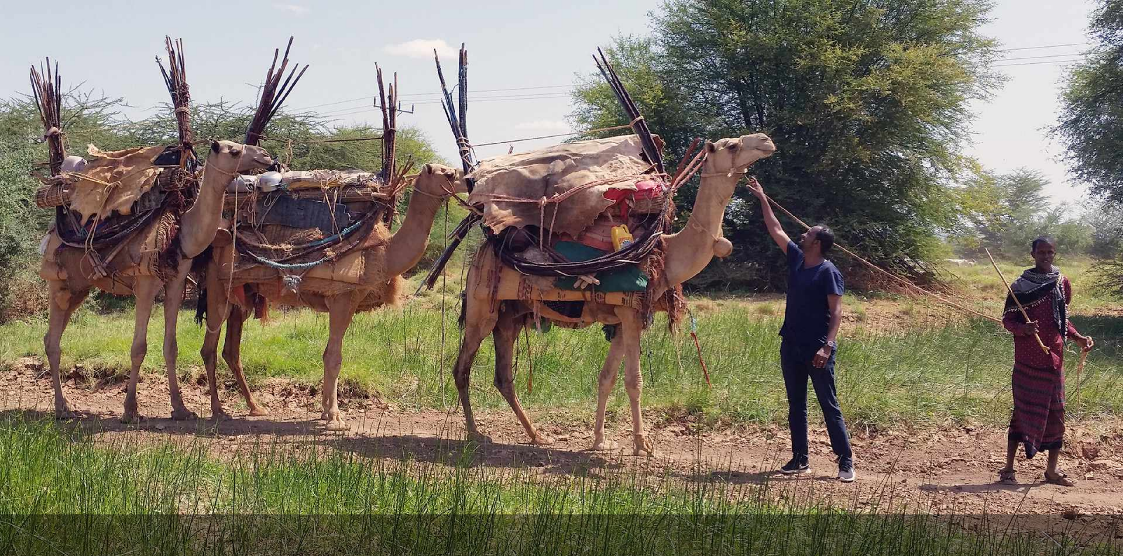
Somali pastoralists in Ethiopia