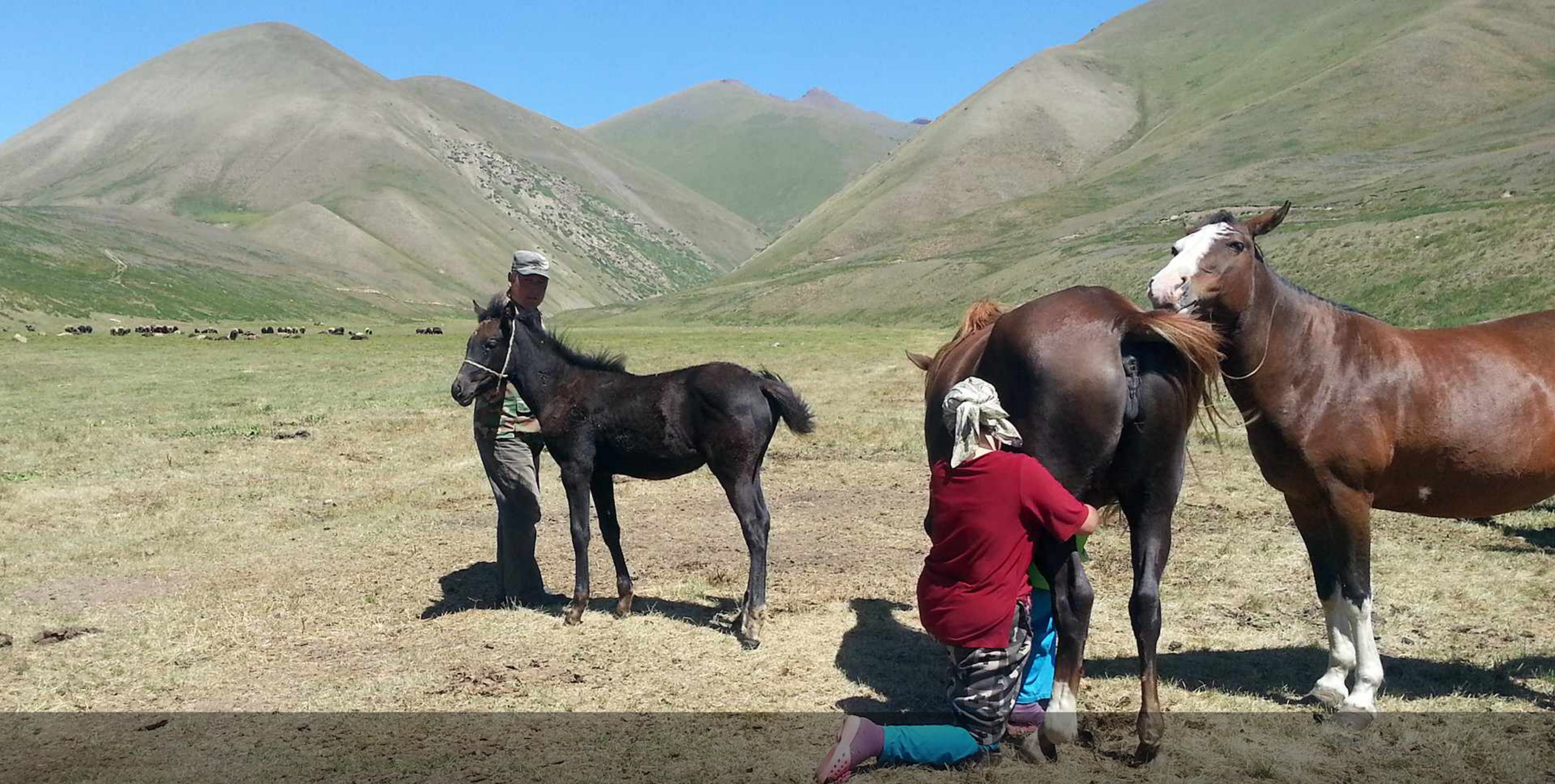
Mobile pastoralists in Kyrgyzstan