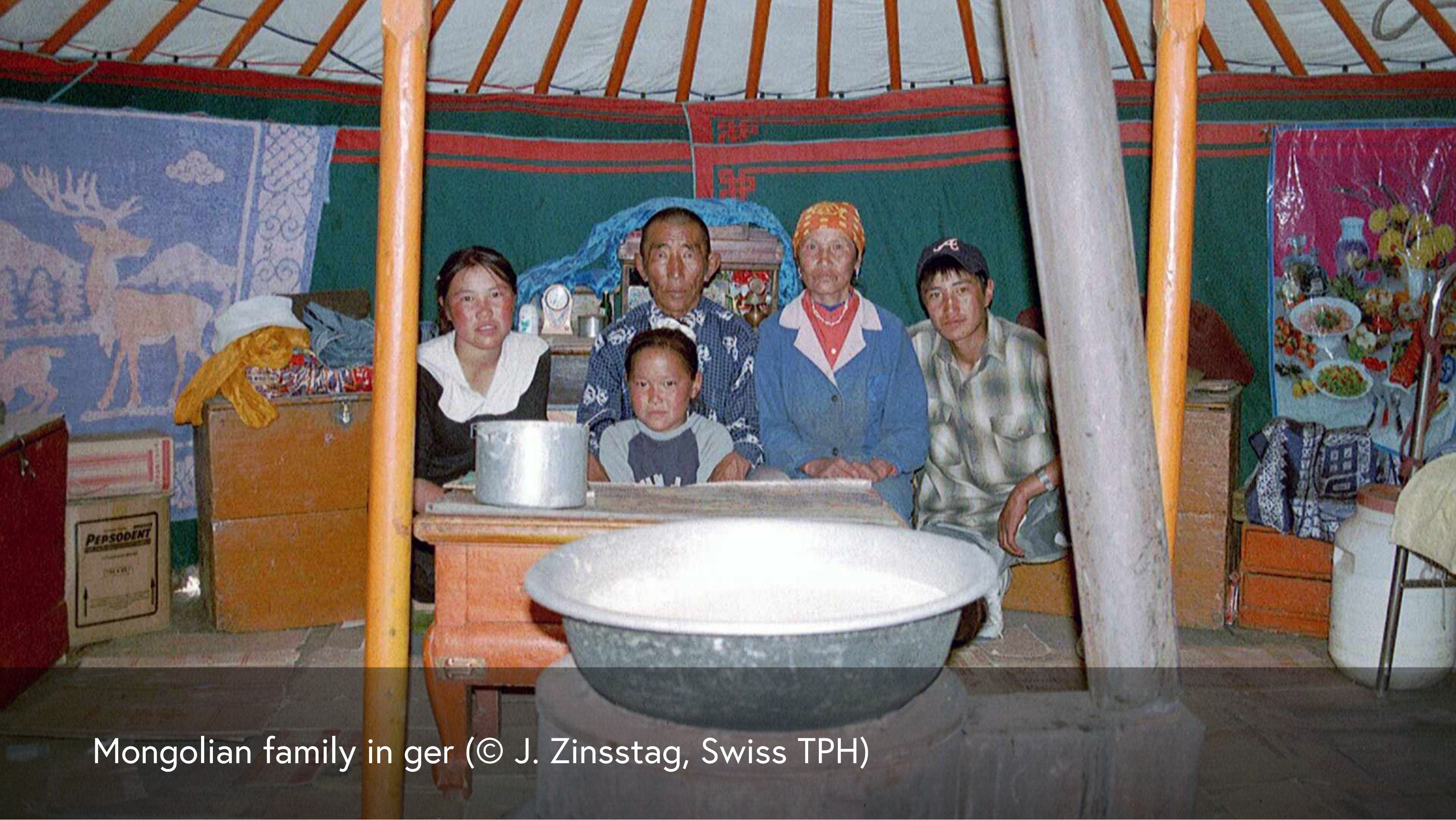
Mongolian family in ger