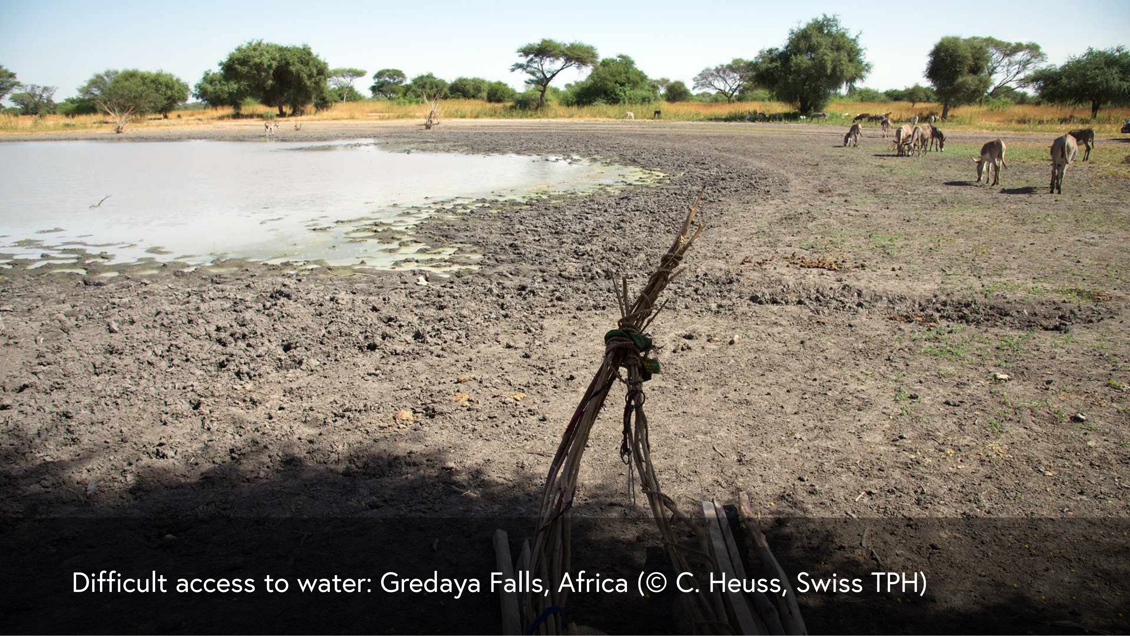
Difficult access to water: Gredaya Falls, Africa