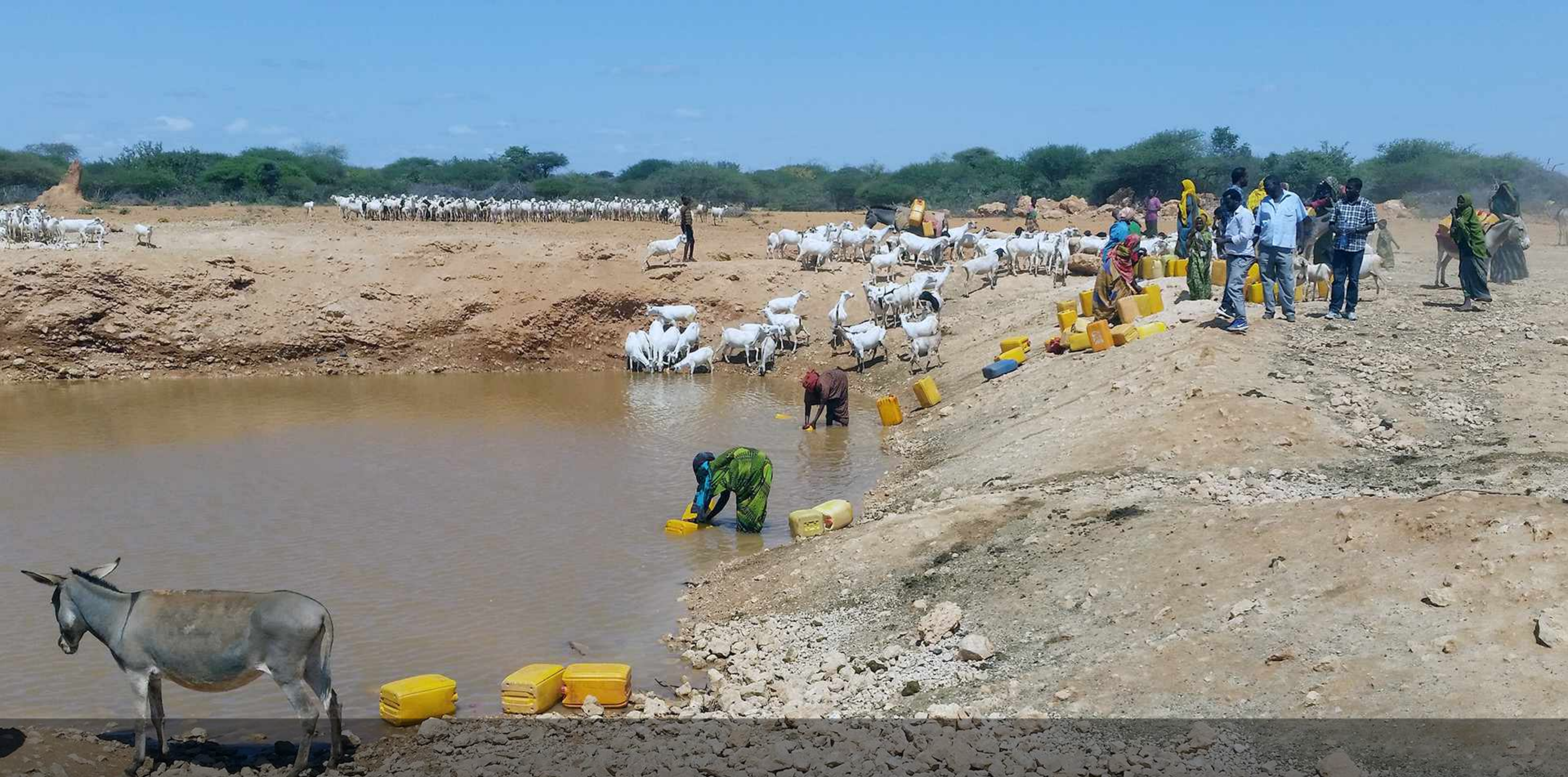
Ethiopia: Water point