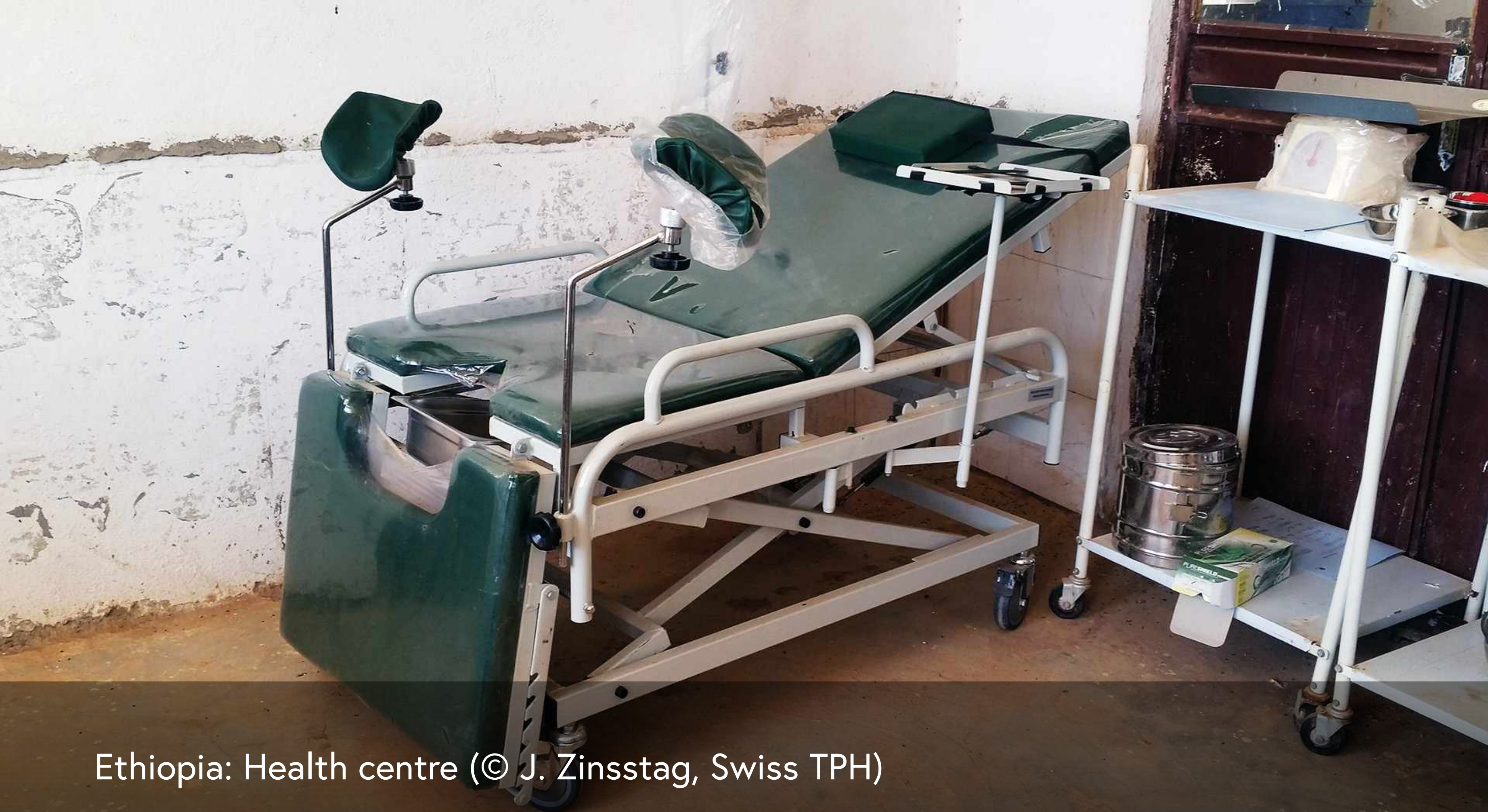
Ethiopia: Health centre