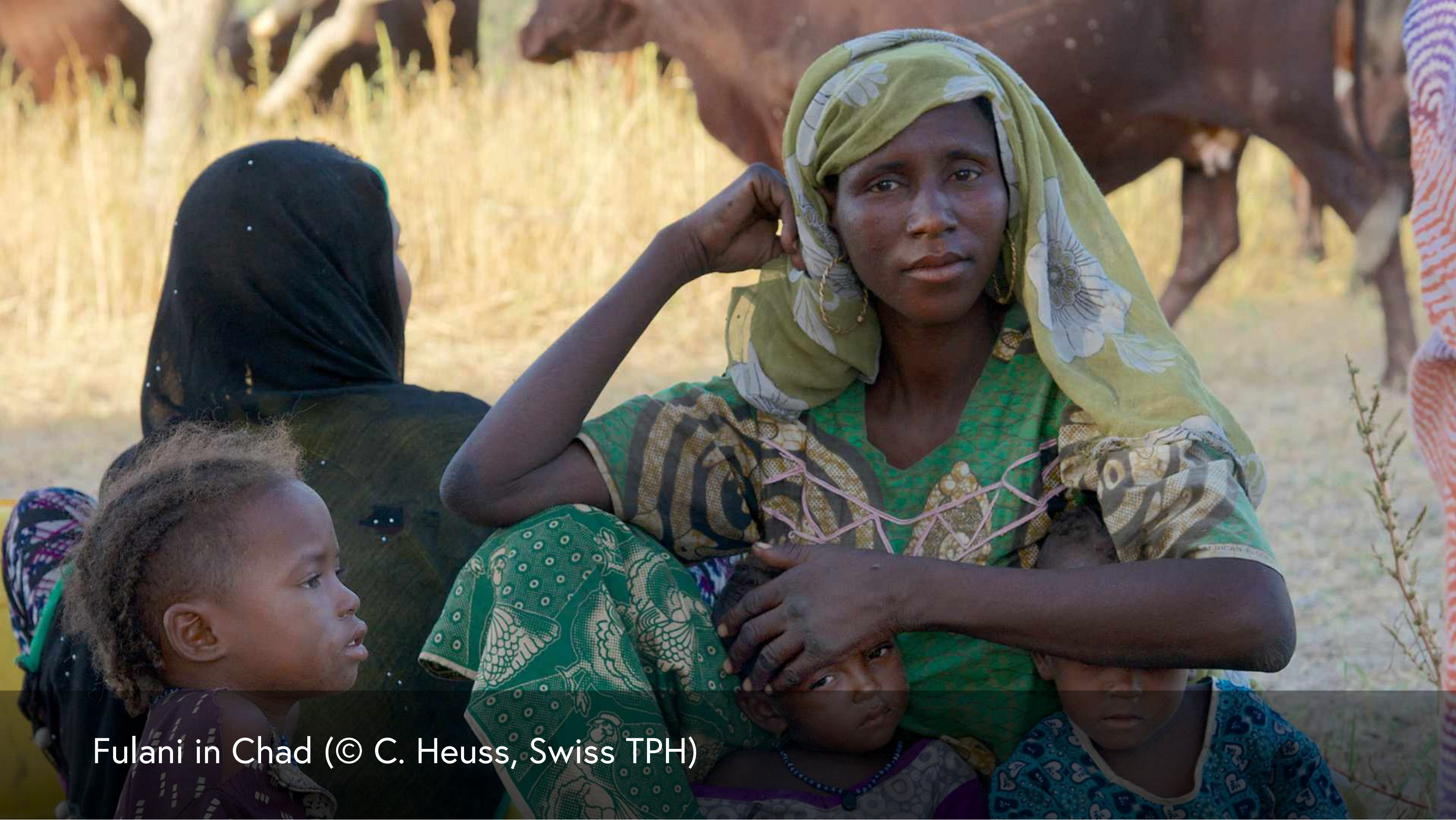
Fulani in Chad