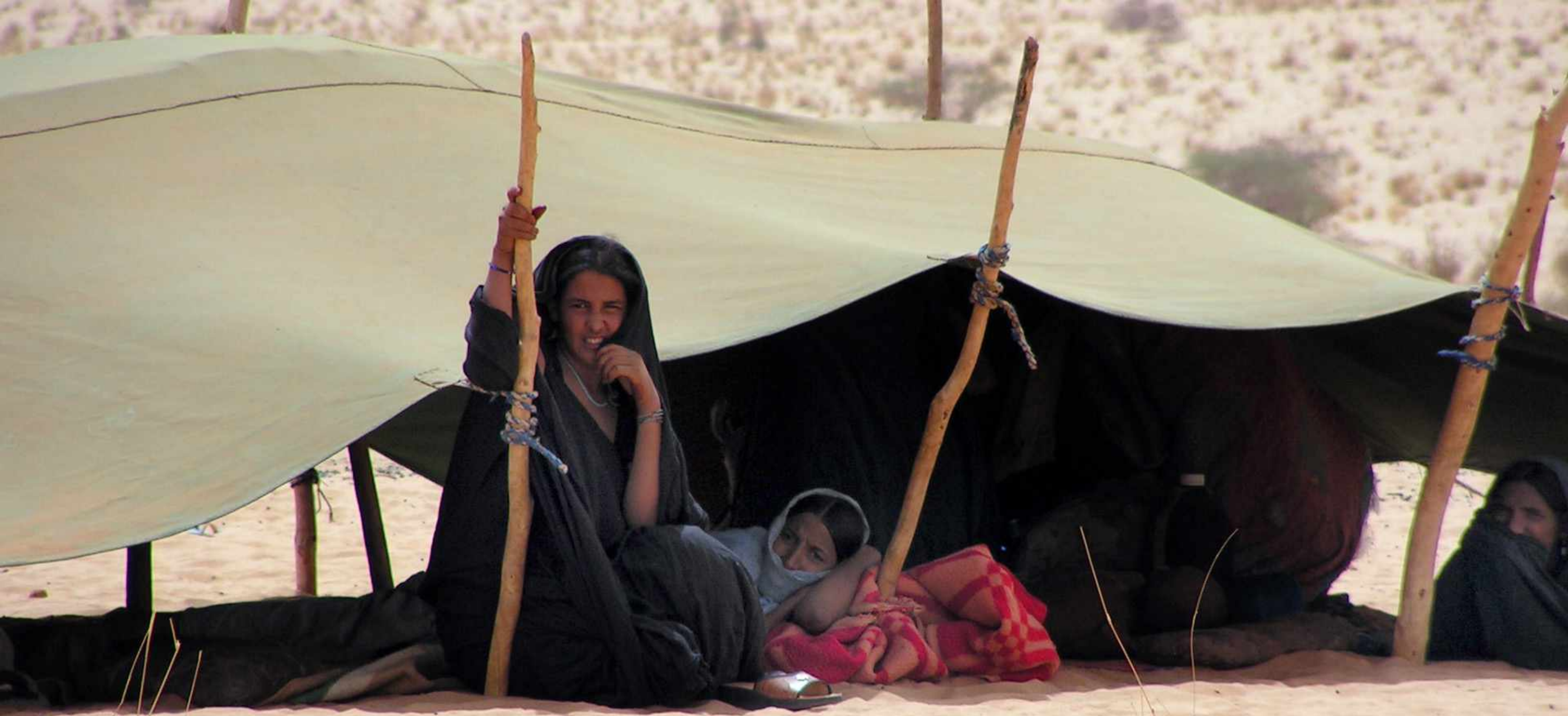
Mobile pastoralists in the Sahelian countries