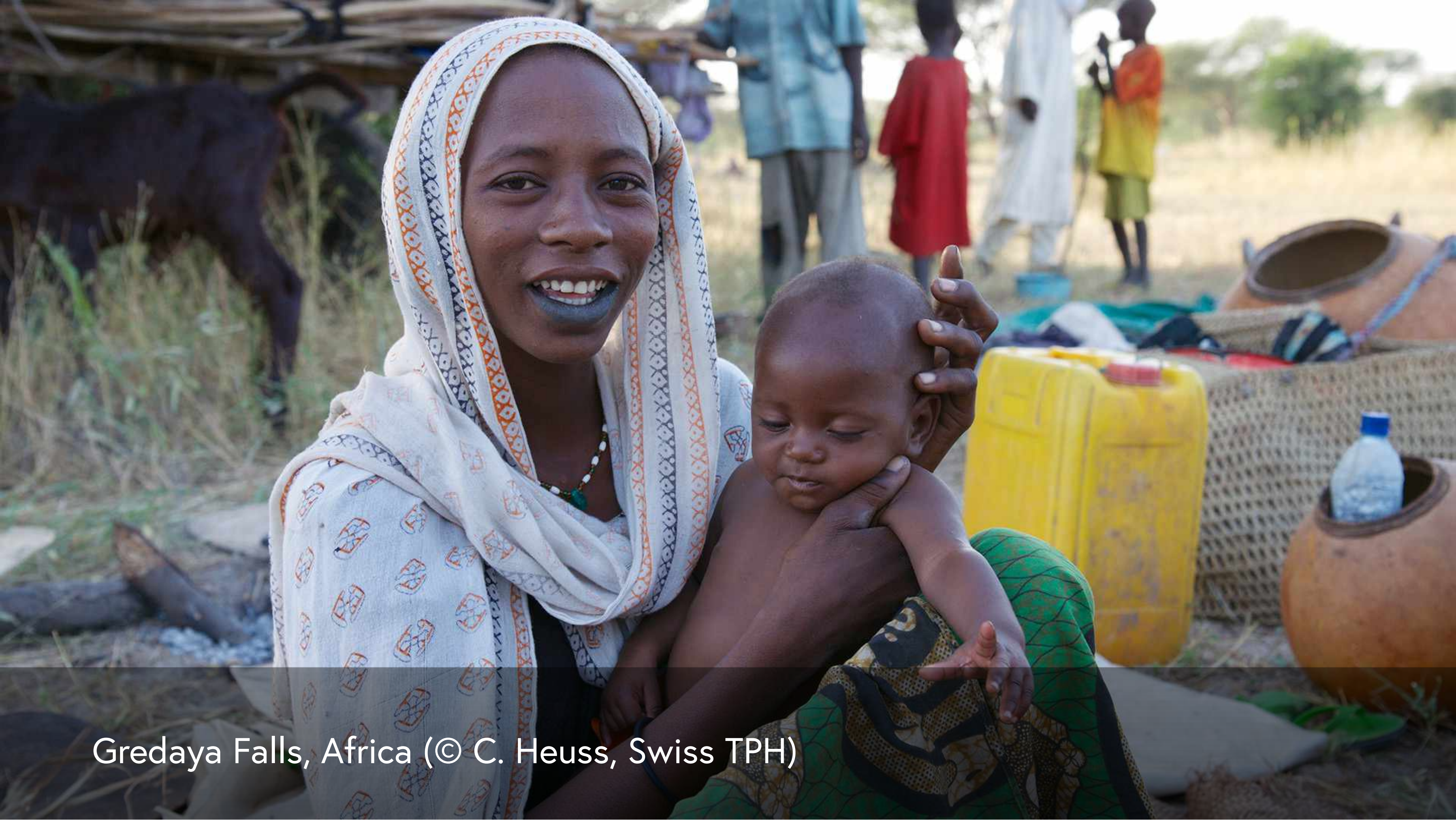
Gredaya Falls, Africa