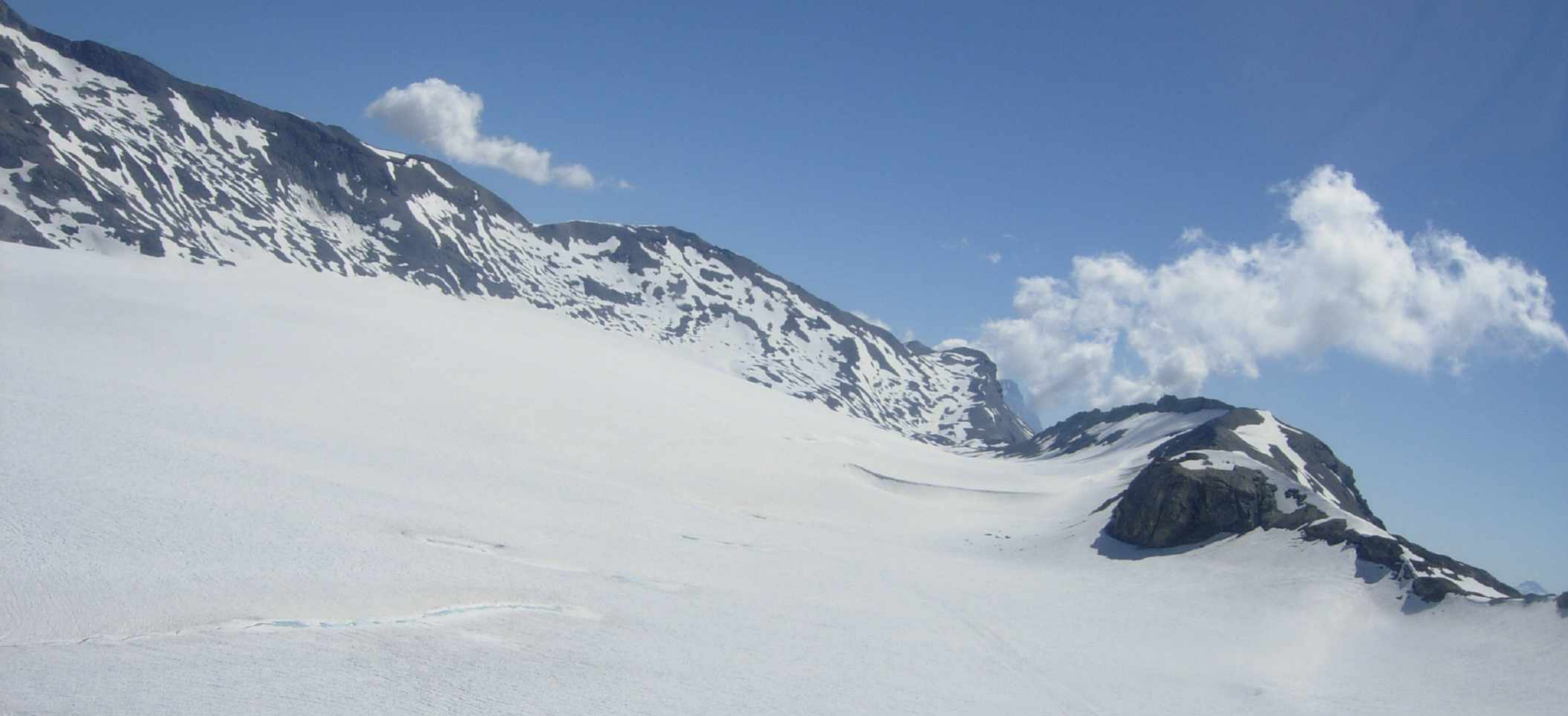
Glacier 'Plaine Morte'